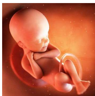
How babies are made